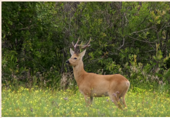
Asiatic Roe Deer