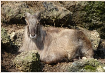
Tahr, Himalayan (Asia)