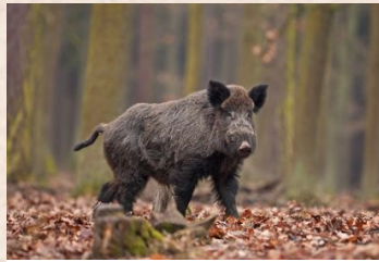
Wild Boar (Europe)