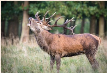
Red Deer/Red Stag (Europe)