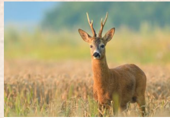
Buck/Roe Buck/Roe Deer (Europe)