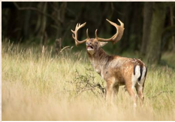
Fallow Deer (Europe)