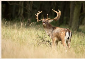
Fallow Deer (Europe)