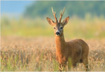
Buck/Roe Buck/Roe Deer (Europe)