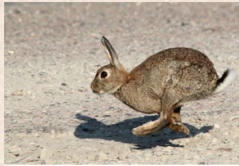
Rabbit, European Wild