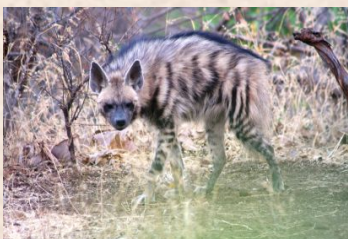
Striped Hyena (Asia)