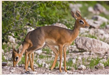
Kirk's Long Snouted Dik-Dik