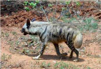
Hyena, Striped (Oceania)