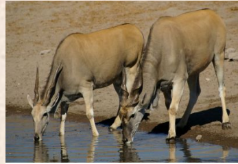
Eland, Cape/Livingstone, Patterson's