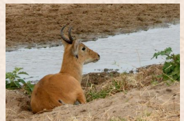
Reed buck, Bohor/Reed buck, Bohor