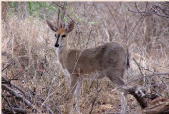
Duiker, Grey/Duiker, Grimm's (Common)