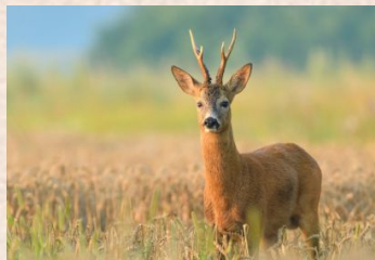
Buck/Roe Buck/Roe Deer (Europe)