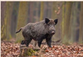
Wild Boar (Europe)