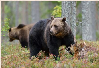
Brown Bear (Europe)