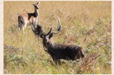
Moluccan Rusa Deer