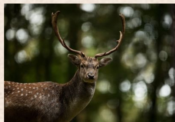
Fallow Deer (Oceania)