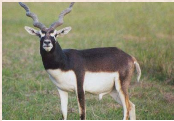
Blackbuck Antelope (Oceanien)