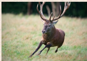
Red Deer/Red Stag (Oceania)