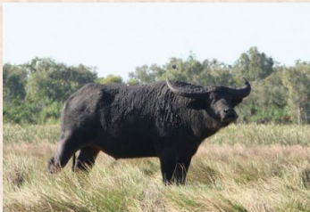
Wild Water Buffalo (Oceania)