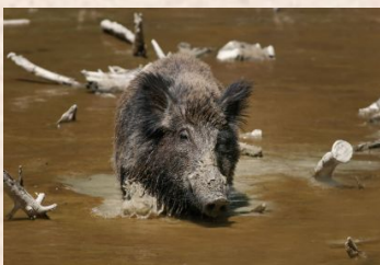
Wild Boar (Oceania)