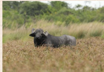
Water Buffalo (South America)