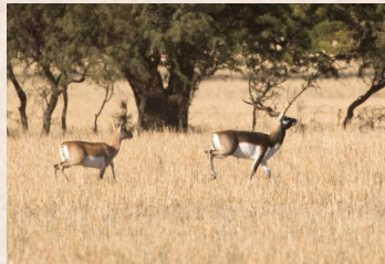
Bezoar Antelope/Black Buck