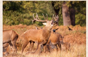
Red Deer/Red Stag (South America)