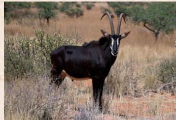
Sable Antelope (Africa)