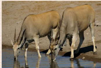
Eland, Cape/Livingstone, Patterson's