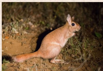
South African springhare