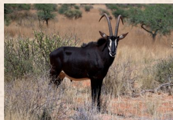
Sable Antelope (Africa)