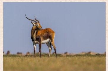
Red Lechwe/Black Lechwe/Kafue