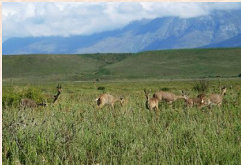
Grey Rhebok/Vaal Rhebuck