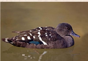
African Black duck*