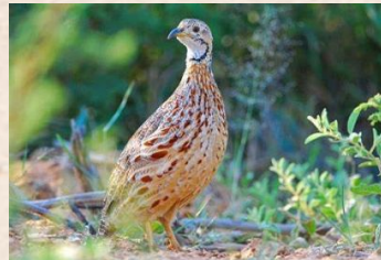
Orange River francolin