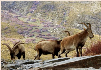
Sierra Nevada Ibex