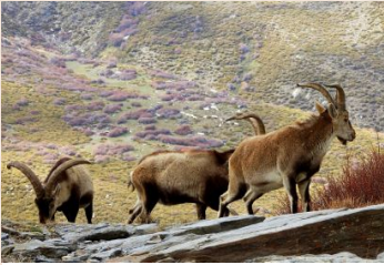
Sierra Nevada Ibex