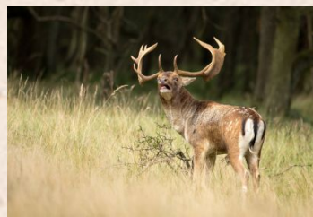
Fallow Deer (Europe)