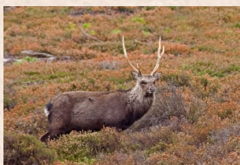
Sika Deer (Europe)